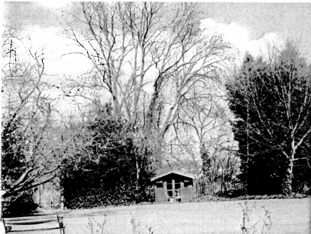
Photo 2 Ash tree, viewed from The Rectory, Stanton by Dale